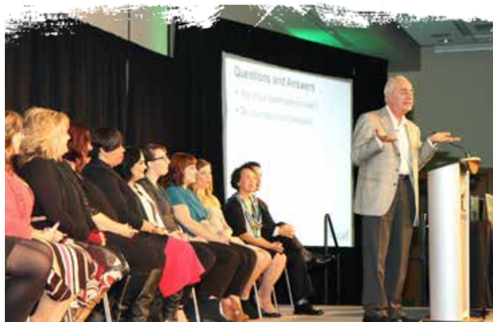
Graduation Day with Style

We love inviting real, successful professionals working in the industry into our classes as guest speakers so they can share their knowledge with our students. Especially, after experiencing success in the salon, many of our graduates will be invited back to share their success stories.