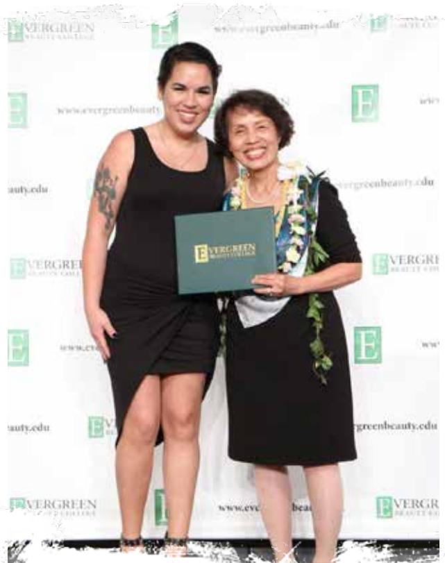
The crowning achievement is celebrating your accomplishment.