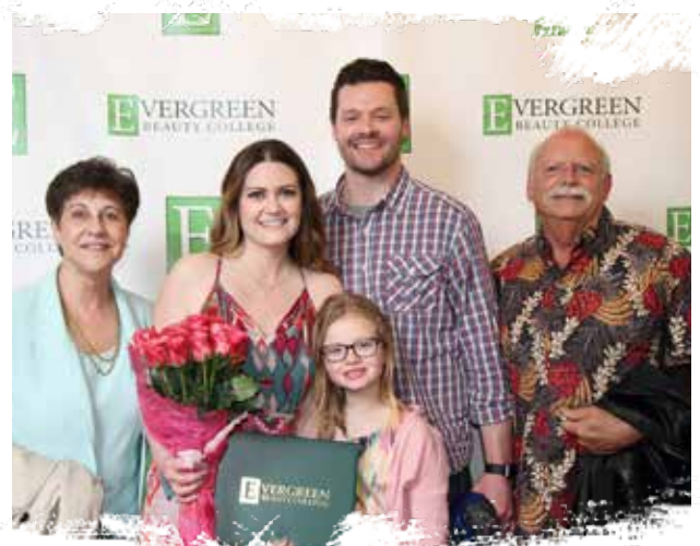
You will have the opportunity to thank all your family and friends that helped support you through this journey.