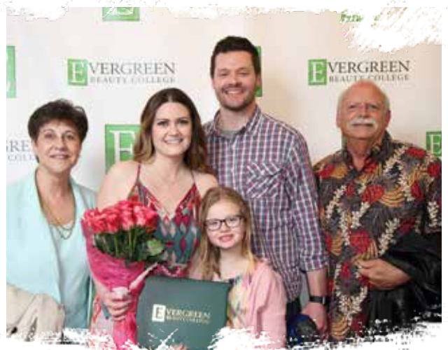
You will have the opportunity to thank all your family and friends that helped support you through this journey.