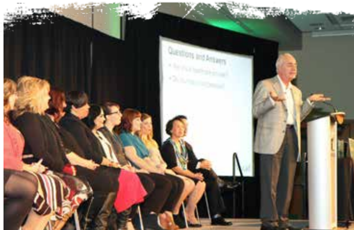
Graduation Day with Style

We love inviting real, successful professionals working in the industry into our classes as guest speakers so they can share their knowledge with our students. Especially, after experiencing success in the salon, many of our graduates will be invited back to share their success stories.