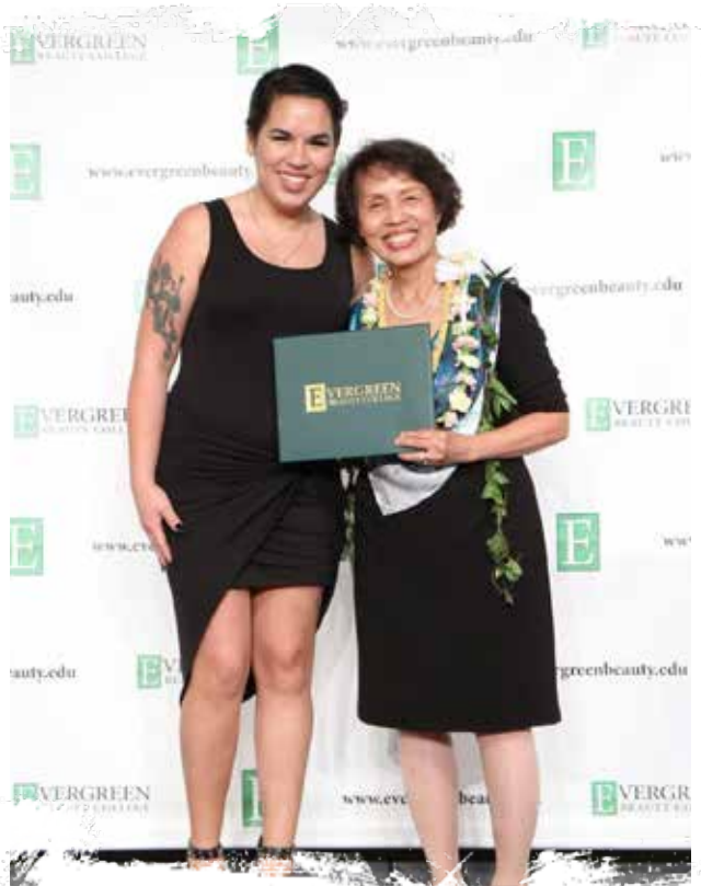
The crowning achievement is celebrating your accomplishment.